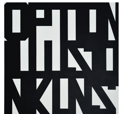
SB oik, 2020, acrylic on canvas, 70 x 70 cm

For further press materials and images please contact: +43 664 22 15 600 | info@gezwanzig.com | www.gezwanzig.com Contact: Ěrika Artahinova